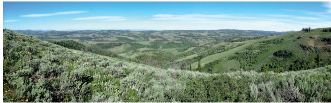
FIGURE 2. Forest patches interspersed within a matrix of sagebrush steppe in the South Hills, Idaho, USA.